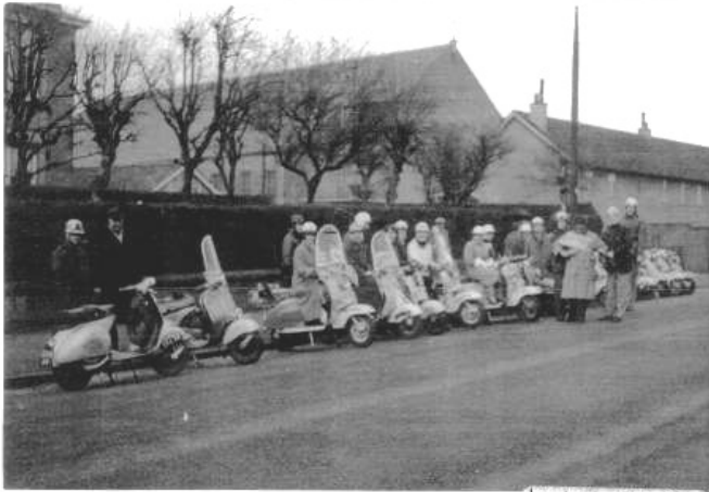
Lambretta Club Escort Caledon Drive - 28 - 11 600

petticoats, a pretty scarf... The boys would wear a nice shirt, tie, blazer and looked so smart. Yes, we were so lucky to be "scootin' around" in the late 50s. I had a circular blue felt skirt for the rally socials and cut out appropriately-coloured Lambrettas from felt and stuck them round the hem along with the correct registration number – it was a fun talking point.